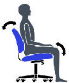
Chair Tilt Lock